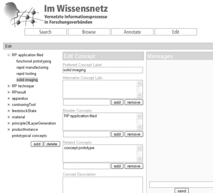
Fig. 2. The collaborative ontology editor in SOBOLEO

1) and existing ones are refined or corrected (maturing phase 2). The users can structure the concepts with hierarchical relations (broader and narrower) or indicate that they are “related”. These relations are also considered by the semantic search engine. That means, the users can improve the retrieval of their annotated web resources by adding and refining ontology structures (maturing phase 3).